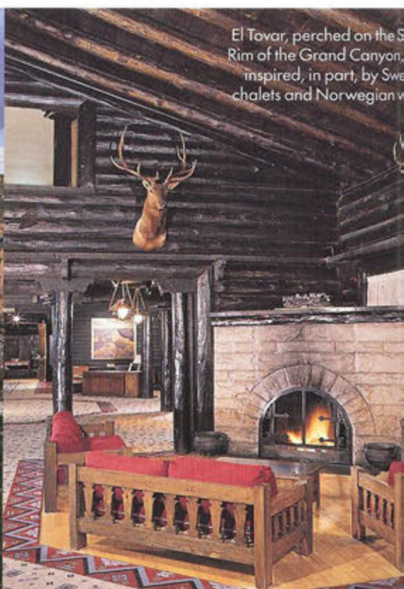
El Tovar, perched on the South Rim of the Grand Canyon, is inspired, in part, by Swiss chalets and Norwegian w